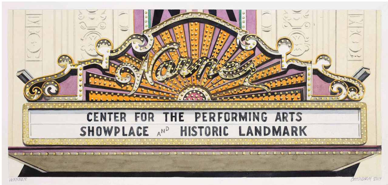
Robert Cottingham, Warner Center for the Performing Arts , 2017, Watercolor on paper, 12 1/2 x 26 1/2 inches

The exhibition kicks off with a critique of the external world, warping our preconceived expectations and defying the conventions of society. Robert Cottingham and Eulàlia Grau start by deconstructing the visual language of the street and state. Cottingham, a pioneer of Photorealism, encapsulates transient typography seen in American advertising, preserving it in a time capsule of colorful signage and retro icons, while Grau constructs collages to analyze and recontextualize the authoritarianism of the Franco dictatorship, feminist commentary, and societal criticism.