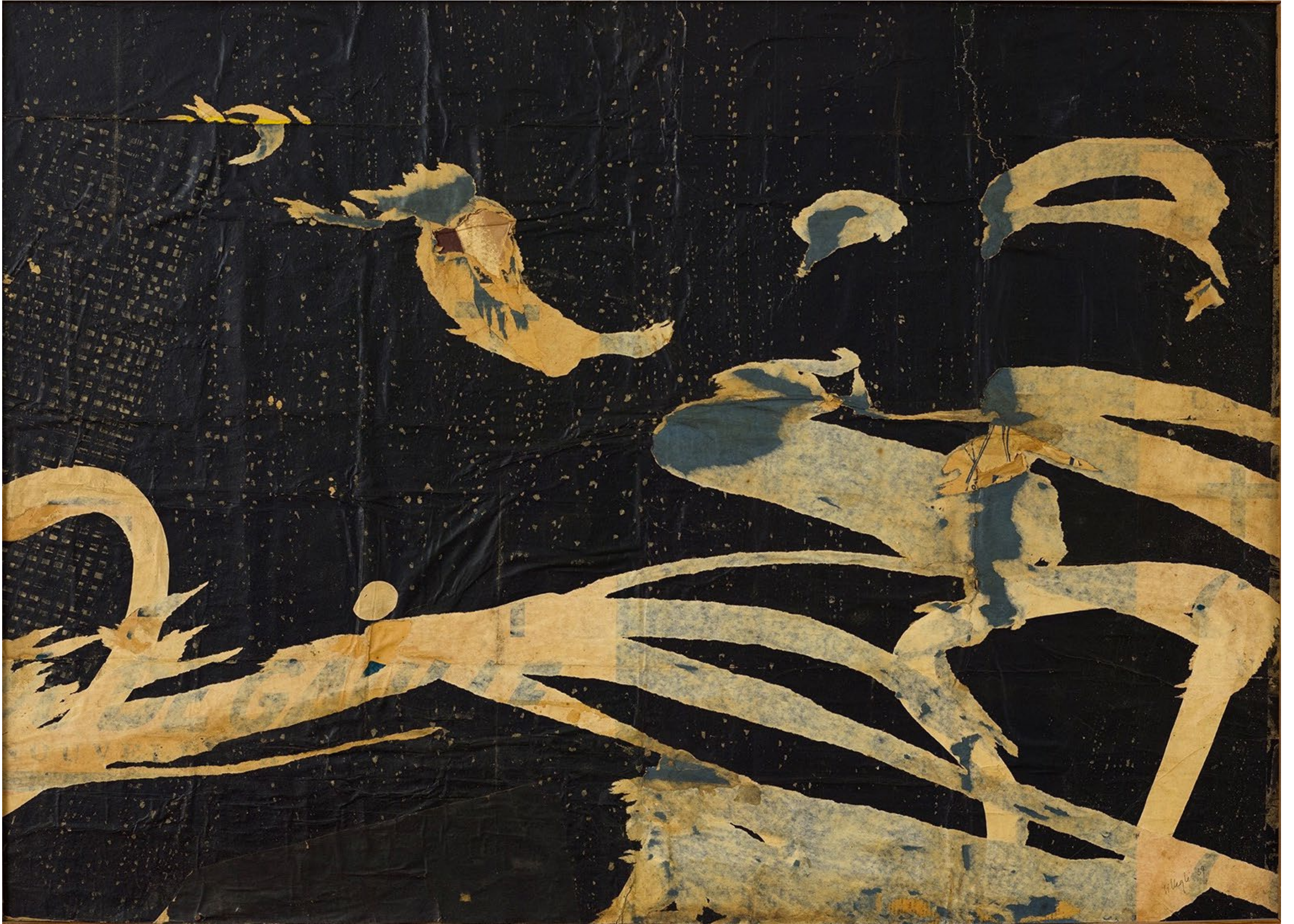
JACQUES VILLEGLE, Avenue Colette Villiers, 25 janvier 1959 , 1959.

© JACQUES VILLEGLE; Courtesy of the artist.