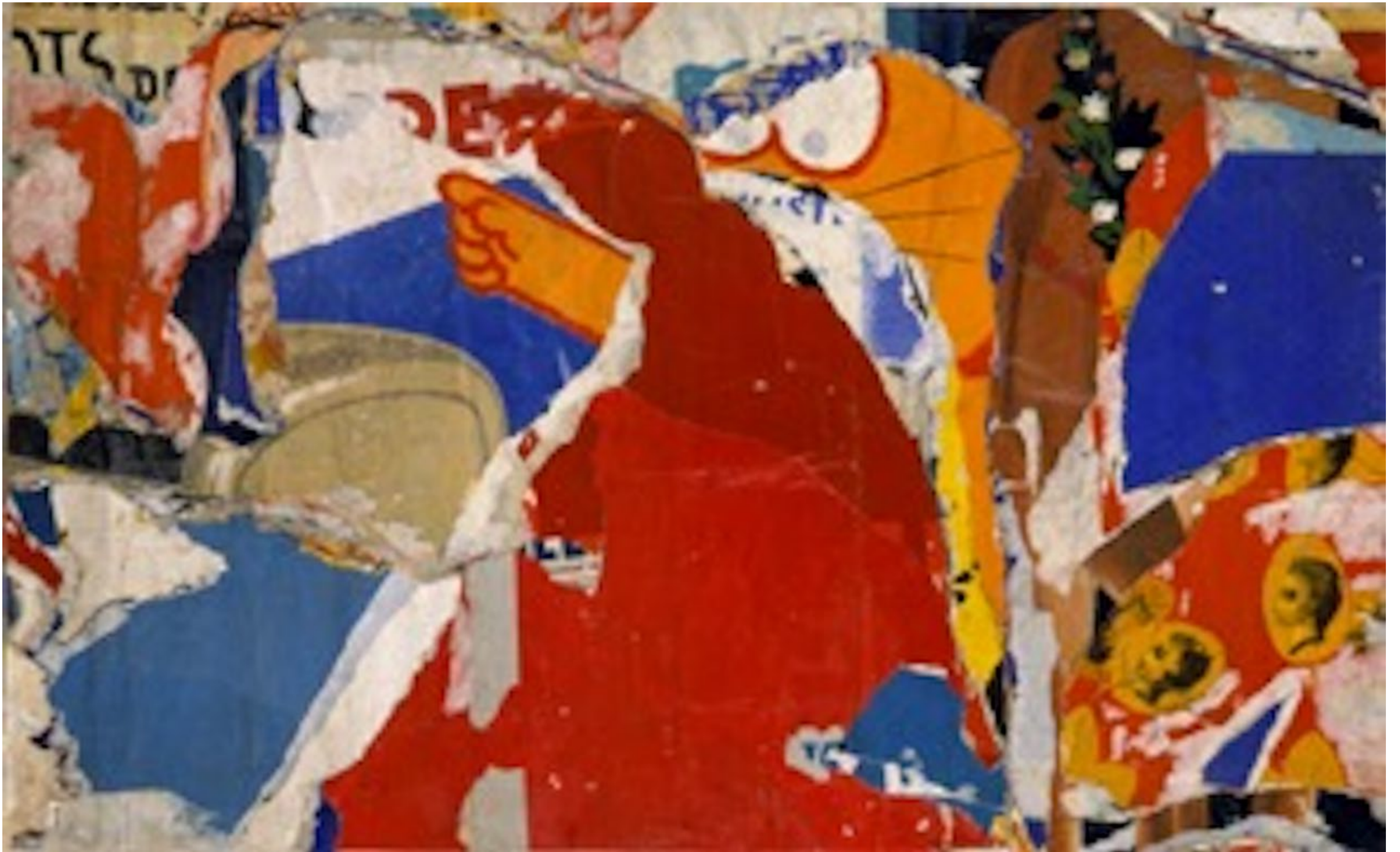
JACQUES VILLEGLE, Rue de Vaugirard , 17 février 1965, 1965.