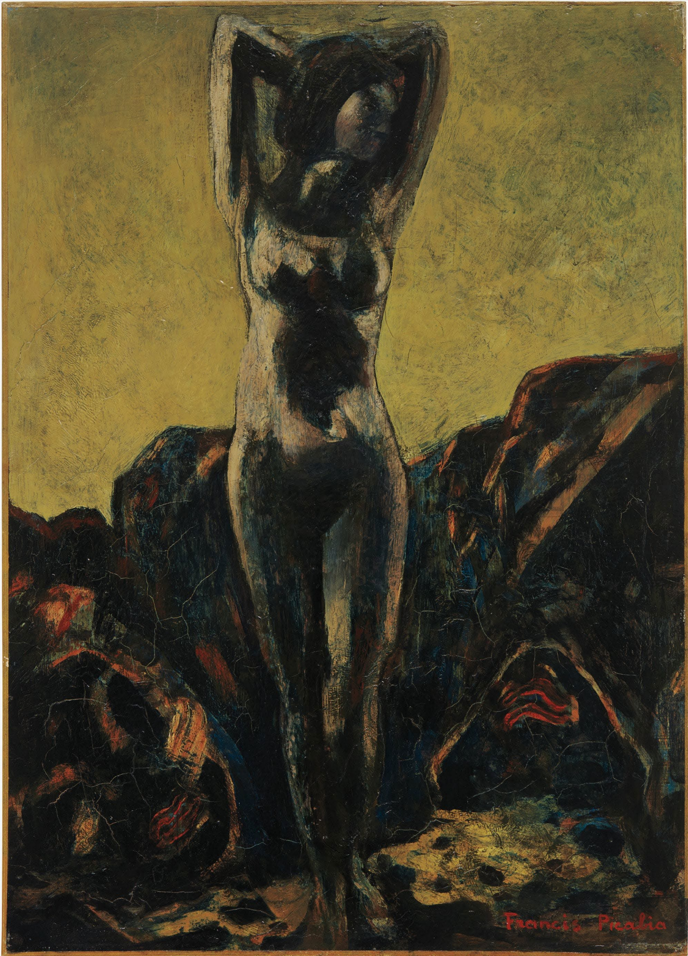
PICABIA Francis, Femme nue , Ca 1939-40.

© PICABIA Francis; Courtesy of the artist.