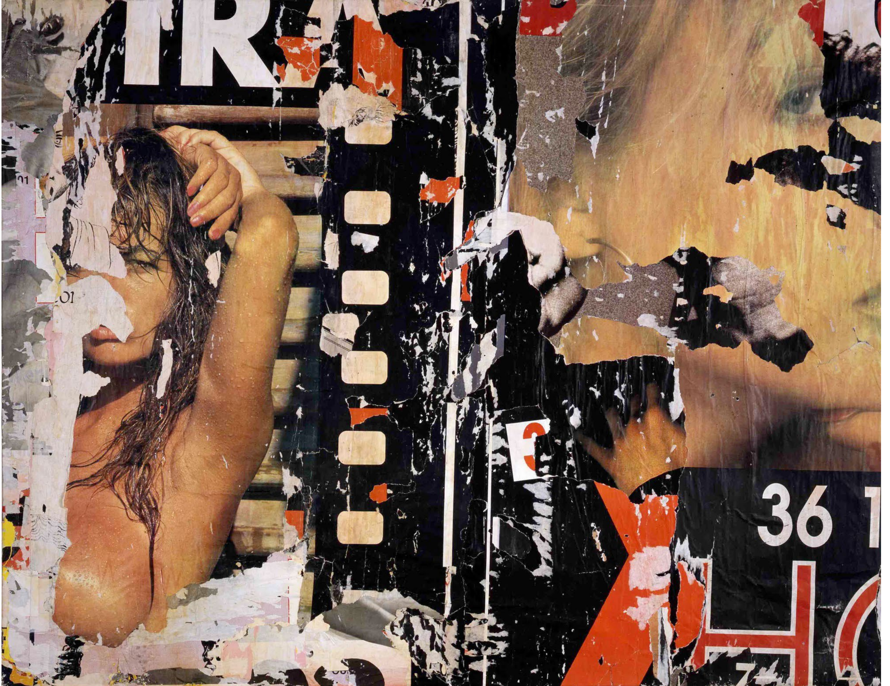
JACQUES VILLEGLE, Bas-Meudon , septembre 1990, 1990.

© JACQUES VILLEGLE; Courtesy of the artist.