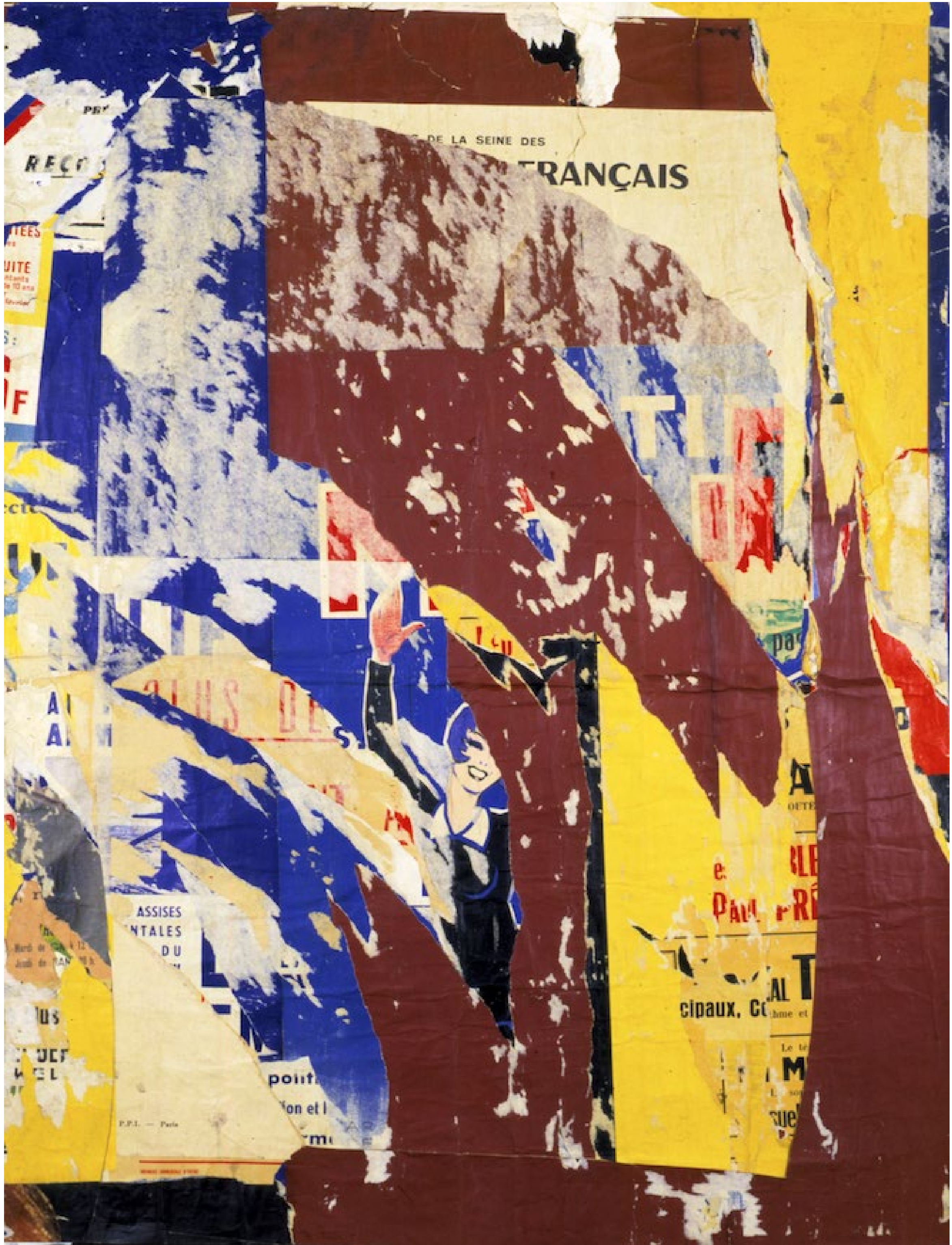
JACQUES VILLEGLE, Rue du Temple - Brune, 14 mars 1965, 1965.

© JACQUES VILLEGLE; Courtesy of the artist.