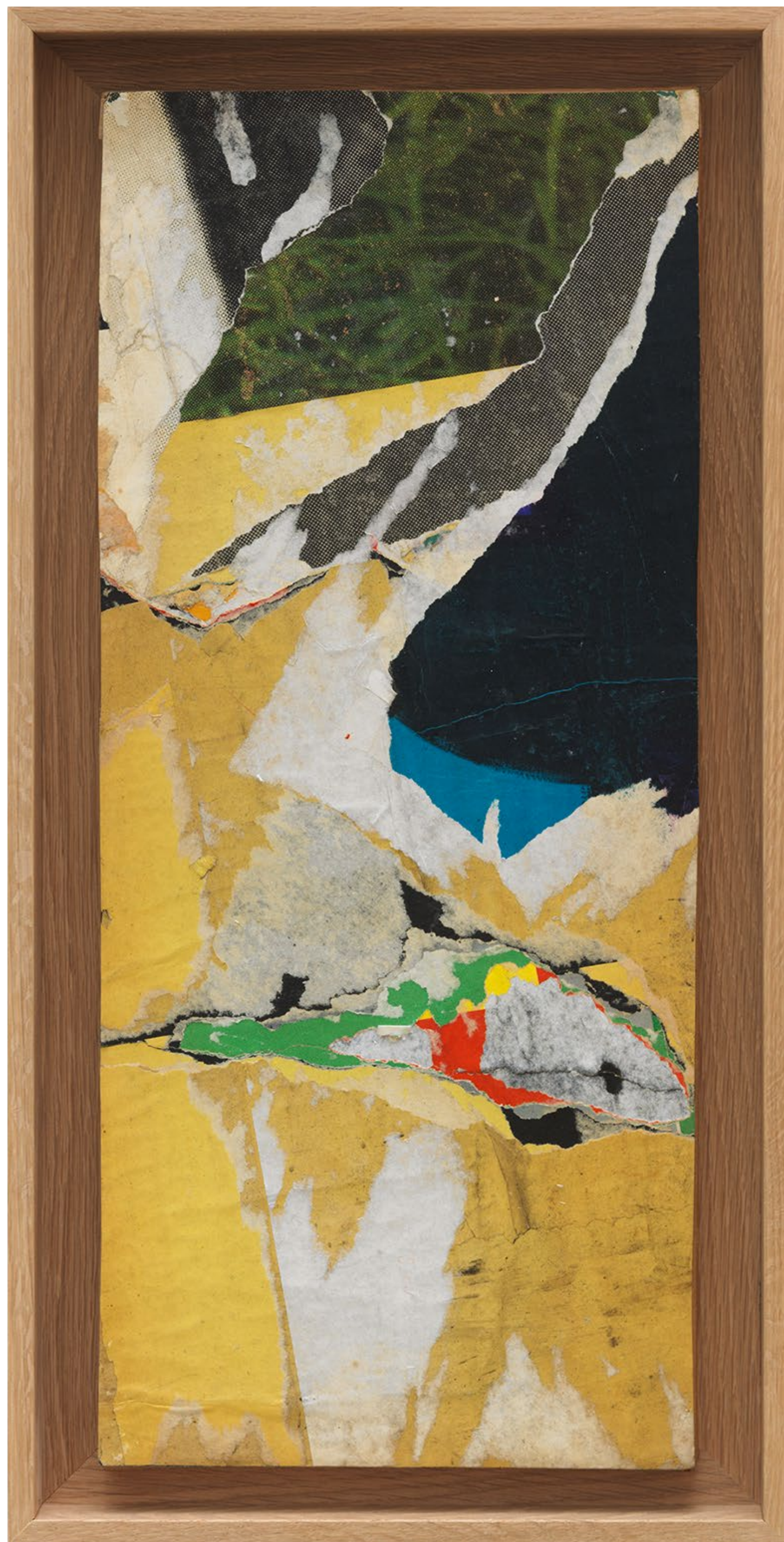
JACQUES VILLEGLE, Rue du Montparnasse, 31 mars 1964, 1964.

© JACQUES VILLEGLE; Courtesy of the artist.